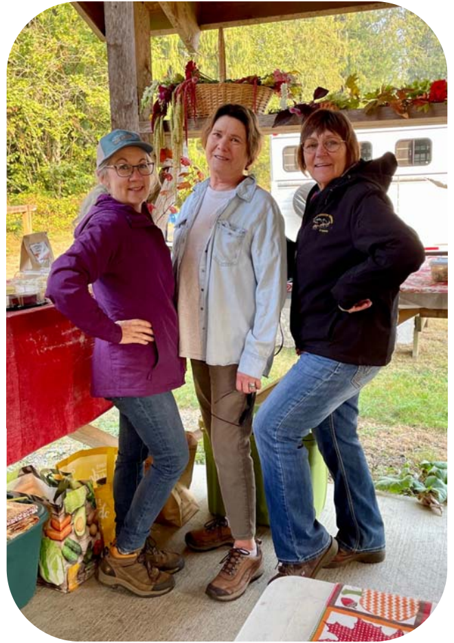
Pictures from Fall Harvest event, October 8, 2022 at Bryce Creek horse camp. Lots of good food and friends! It was a really nice day for a get together and ride!