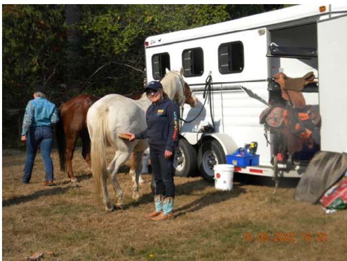
Fall Harvest event pictures.

209 Ferry St. Ste A, Sedro-Woolley, WA 98284 (360) 854-9415 pnt.org