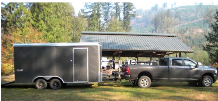
More Fall Harvest pictures. The new Whatcom BCH trailer.