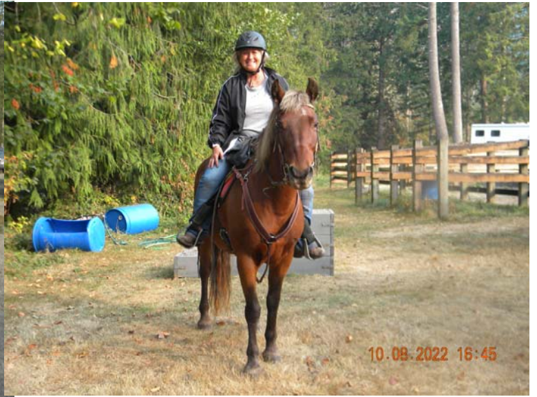
More pictures of the Fall Harvest event at Bryce Creek horse camp.