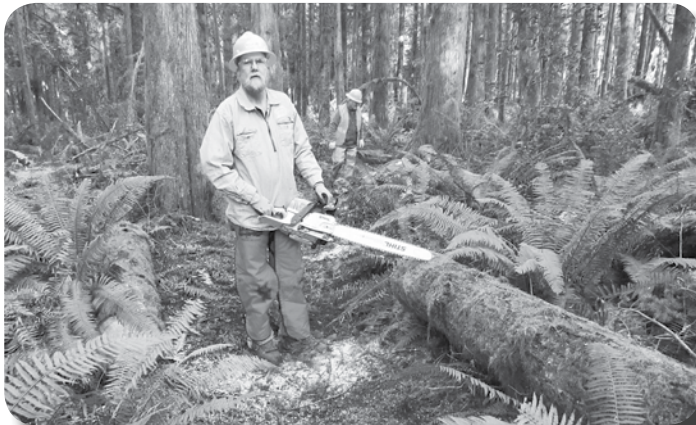
2019 January work party has removed the log.

so he can redeem himself at the next work party. I share this personal note simply because it is an appreciated illustration of the teamwork involved with individual growth within the BCH organization.