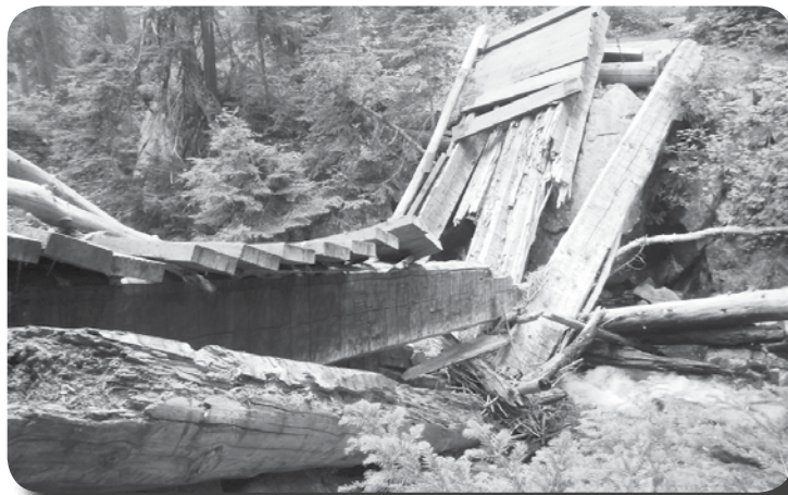
Bridge Creek bridge, North Cascades NP

back to the trails as soon as he was able to resupply, a cycle he repeated from late spring until the snows came in the fall.