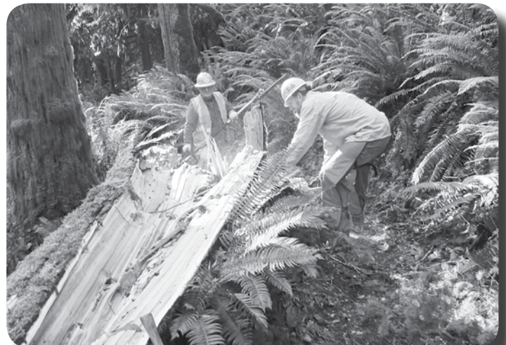
2019 January work party cotton wood shard.