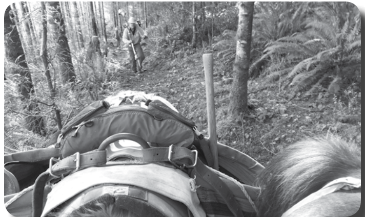
2019 January work coming out of the woods.