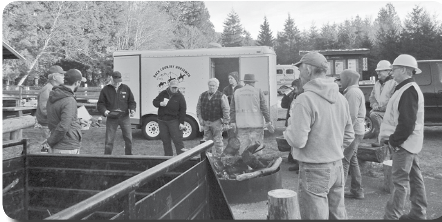
2019 January work party safety meeting