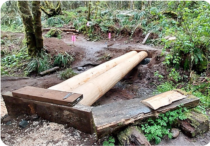
Stringers for the new bridge are in place and ready for decking.