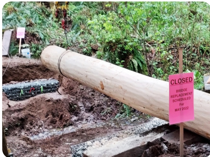
Using cables, pulleys, and Gripjoists, the stringer pieces are moved into place onto rock-filled gabion-basket foundation.