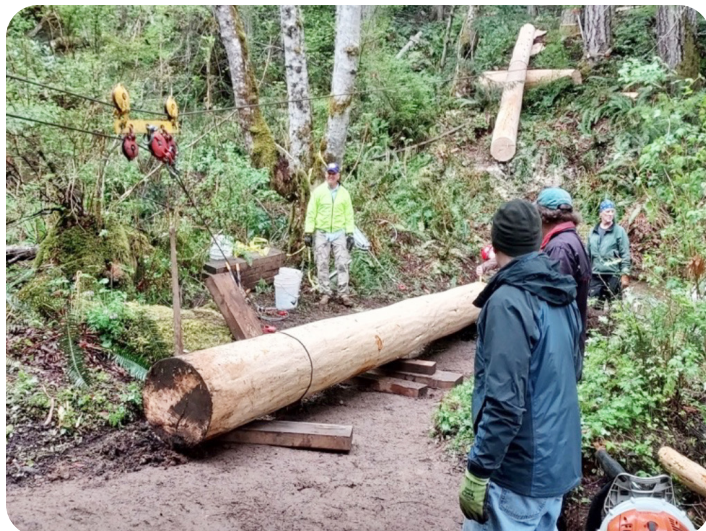
Using cables, pulleys, and Gripjoists, the stringer pieces are moved toward the bridge site using BCHW expertise.