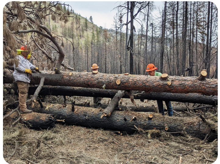
Wolf Creek Trail Methow Ranger District