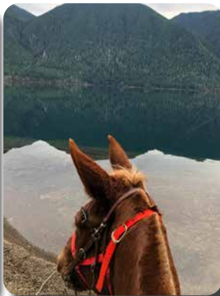
Fivey enjoying the view.