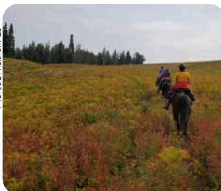
Ride from South Leigh through colored meadow.