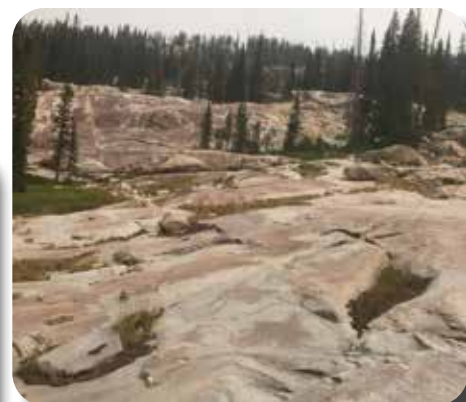
Some of the rock formations on ride from South Leigh.