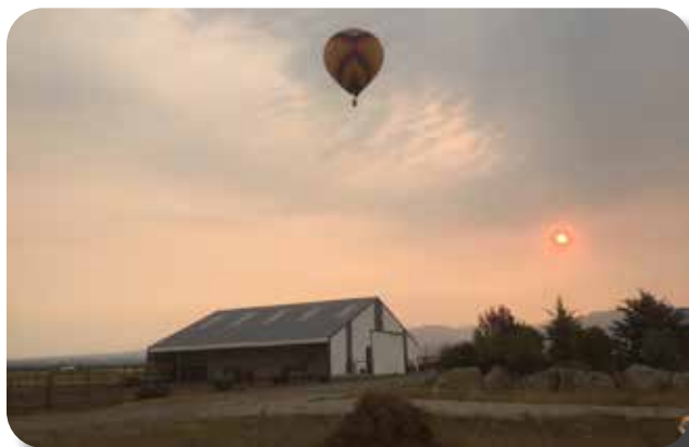
Sunrise at Ears the Place.