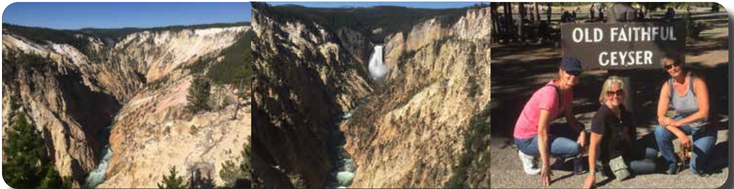
Grand Canyon of Yellowstone. Taken as a tourist, not a horseback rider.