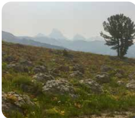
The rocks that used to be on the ocean floor but are now at 9,400 feet with the Tetons in the background, hazy due to the Northern California fires.

Driggs, ID was a great restocking point for our group. There is a nice grocery store, feed store, and a laundromat nearby. Just down the road is a vodka distillery that we felt "obligated" to tour and Jackson Hole is a few miles to the east over Teton Pass. We spent one day touring Jackson Hole, starting the day by tagging along with Elaine to an estate sale. We sampled all the tourist activities that Jackson Hole has to offer, shopping, getting our picture taken under the antler arch, and sitting on the saddle bar stools at the Million Dollar Cowboy Bar. A rowdy dinner at a nice restaurant led to another patron motioning us to be quiet but it was an unsuccessful attempt that resulted in our invitation for her to join us. It was declined. 🐾