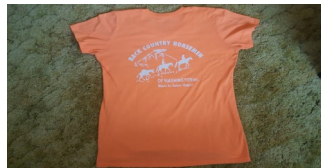
Neon Orange - COTTON - with regular logo (front & back) Ladies