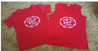
Red shirts - POLYESTER - with newest logo (Front only!)