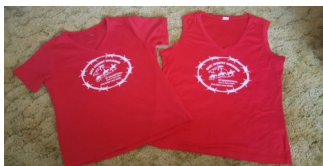
Red shirts - POLYESTER - with newest logo (Front only!)

Try to use a durable surface for taking a break or setting up the tent so you do not crush pretty foliage. Also, choose a campsite where trees or something blocks the view from others. People like to see trees, not tents, and tables. Stay away from brightly colored tents that do not blend in with the natural flora and fauna. These can create a crowded feeling for others. Always keep pets under control. Generally, other people do not like dogs jumping on them or rummaging through their garbage. If you see garbage on the ground, it is nice to pick it up and pack it out. This helps the parks look better for others to enjoy. The list goes on and on, but the main point is to just be considerate to others . It does not take much energy or time and if you are kind to others, they will be kind to you. Here is wishing you a Merry Christmas or Happy Hanukkah or simply Happy Holidays and a Happy New Year!! May 2023 bring you happiness and good health!