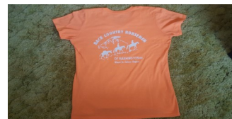
Neon Orange - COTTON - with regular logo (front & back) Ladies V-Neck

I would be happy to meet people at feed stores in: