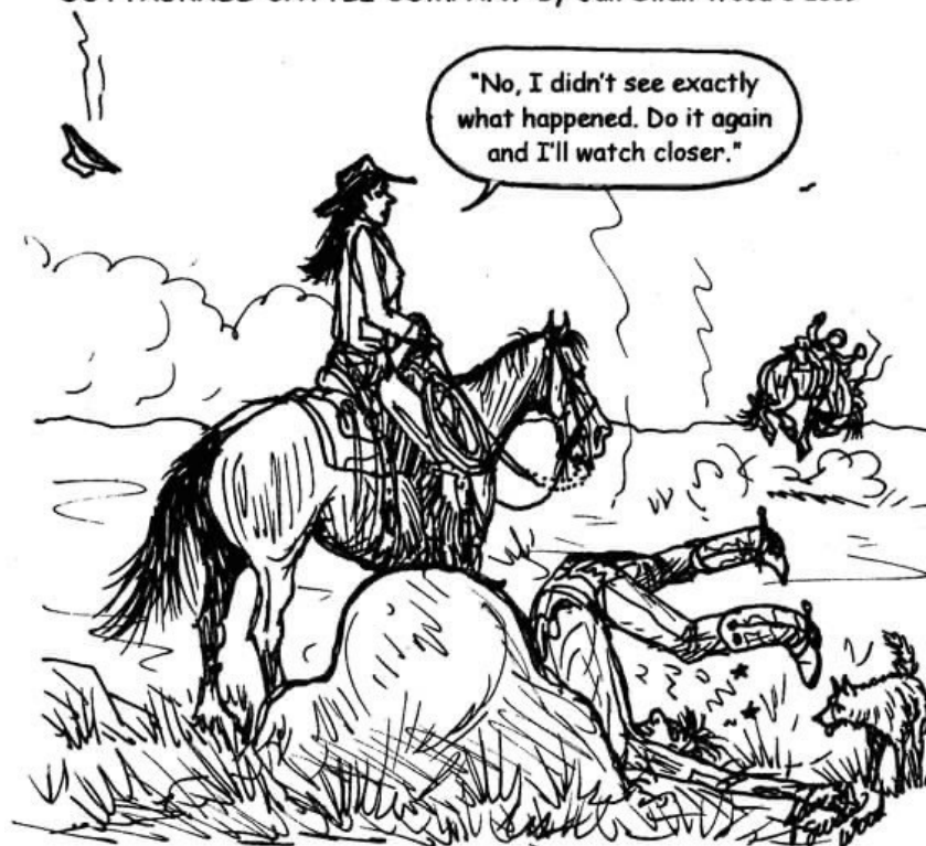
OUTTAGRASS CATTLE COMPANY by Jan Swan Wood c 2009