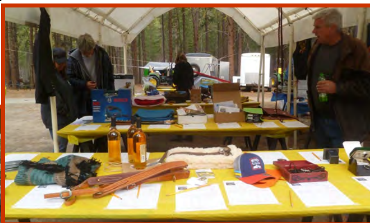
Auction tables ready for Bidders to return from the Ride and make their bids!