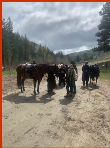
Overall, weather wasn't perfect, but it was certainly OK...