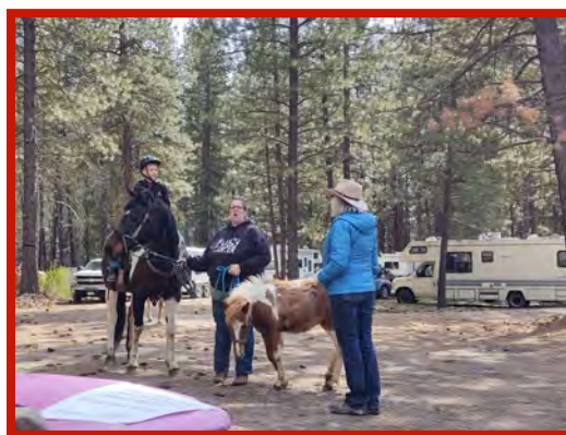
There were lots of horses of all shapes and sizes; it was fun to meet the smallest ones too!