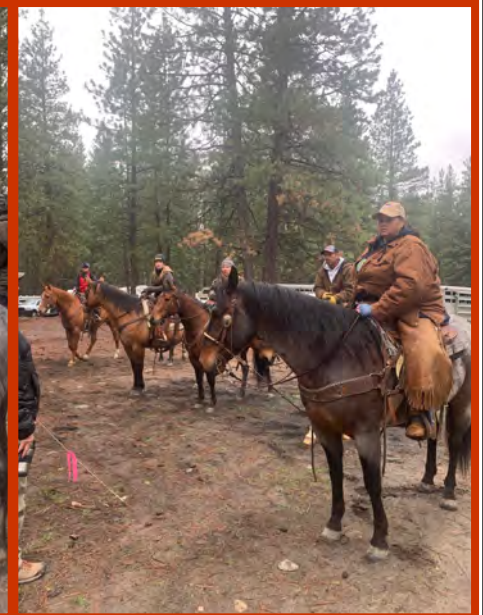
...when almost everyone wore rain gear...