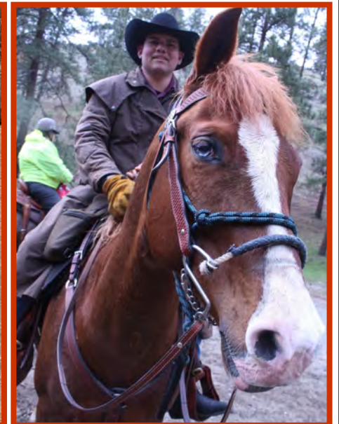
...say hello to friends they hadn't seen in a while, and help unload the buy-it-now items for sale.