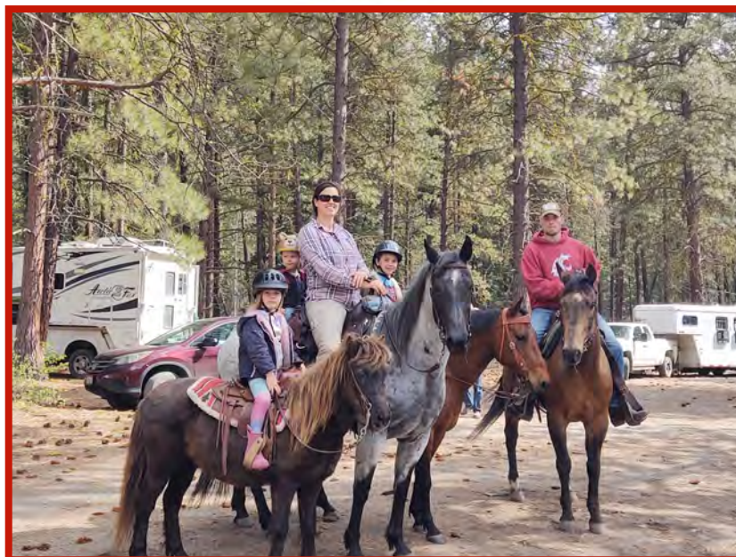
We even had a family of 5 who rode together every day! (Yes, there are 5 people in this photo—one is a 2 year old who is sitting behind the Mother in the center of the photo!)