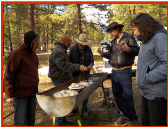
Sunday A.M. Breakfast