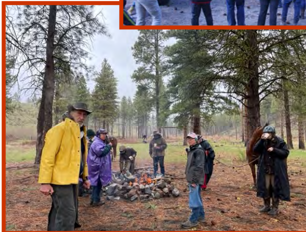
Coffee break on the Ride