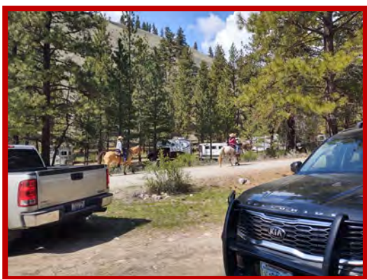
Early arrivals started walking their horses to loosen them up a bit after the journey. Weather was perfect!