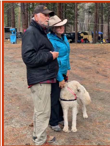
...and people felt comfortable to walk about and check out the auction items...