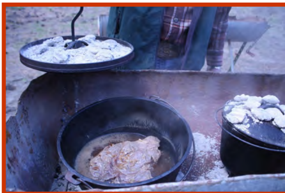
Friday eve Pot Luck