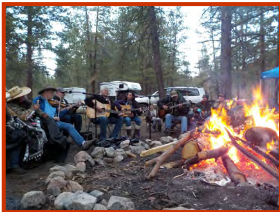
Saturday night mu- sic entertainment