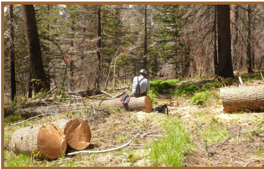
It never ends... our Trail Boss Bill Ford taking a short rest after finishing cutting out the most westerly log on the Twisp River Trail near the trail-head at (North Lake).

There are quite a few clearing up tasks to be done by small work parties. Please help when you can.