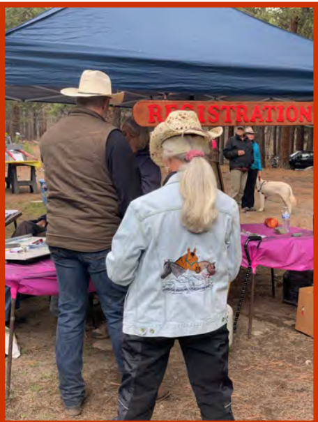
Registration went smoothly, the canopies were erected securely and safely for the auction...