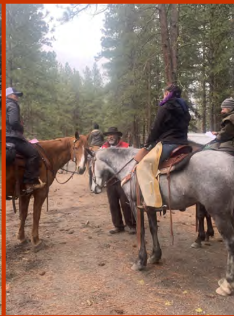
...except for the day of the ride...