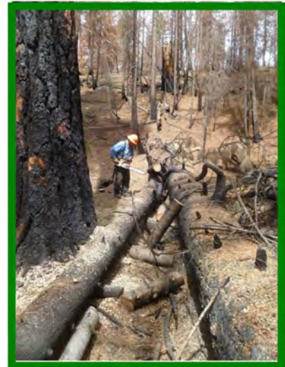
Twisp River Trail June 2019