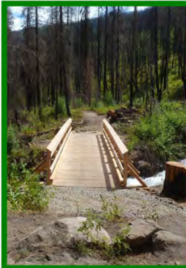
Eagle Creek Bridge after Crescent Mountain fire 2018 (L) and after a rebuild 2020 (R)