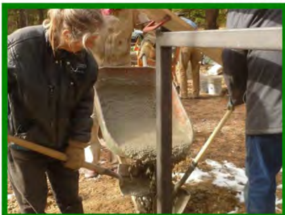
Concreting in high line posts Oct 2020 ←