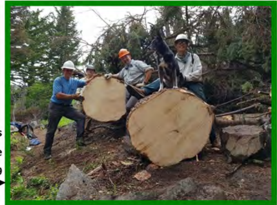
Twisp Pass Trail, June 2019 →