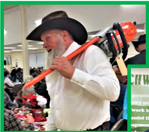
Our chapter donated a chainsaw which sold for a very good price as well.