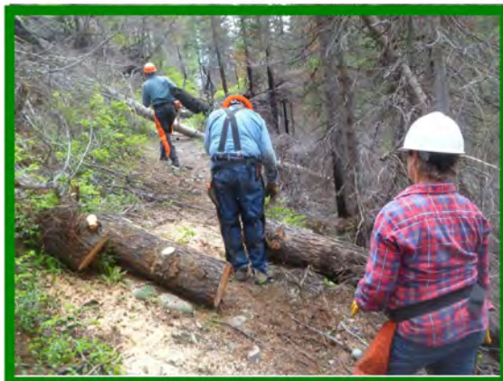
South Creek Trail 2019 ←