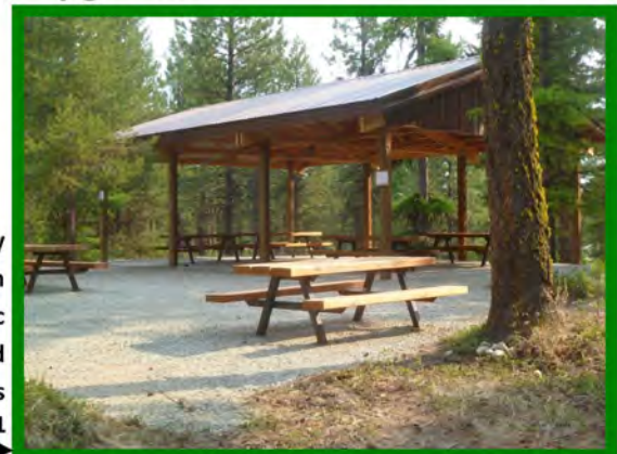
Day Area with Picnic Shelter and tables 2021 →