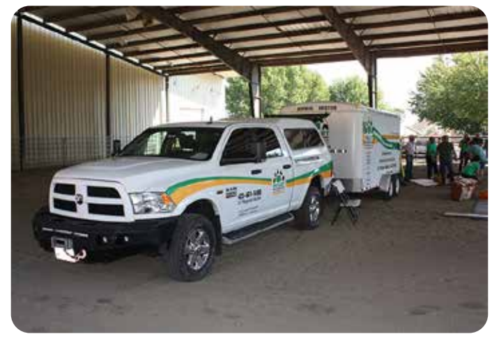
WASART truck and trailer