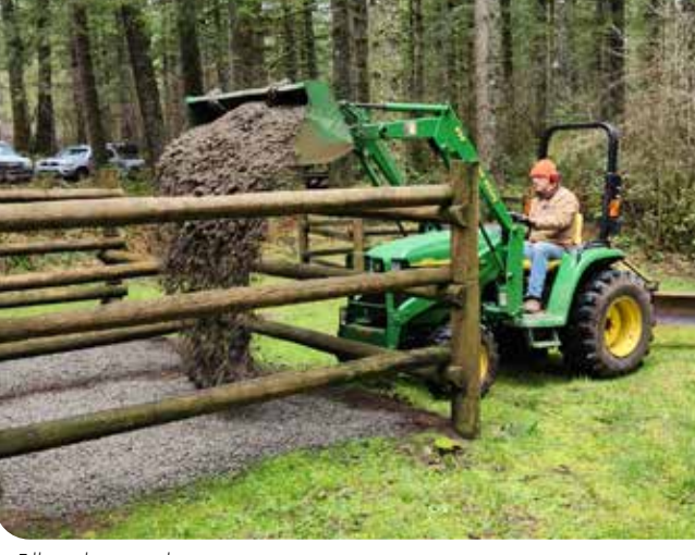
Setting matts on bridge.