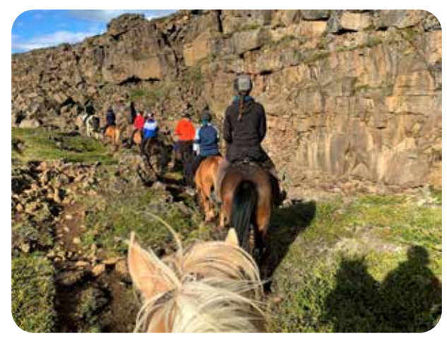
Along the high wall of rock.