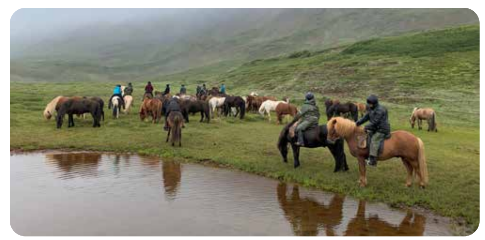
Horses in mist around pond