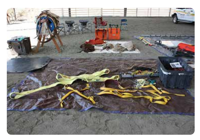
WASART equipment laid out on a pack prior to weighing and folding.

Not all backcountry horse people are aware of WASART, and they (WASART) were not well versed in