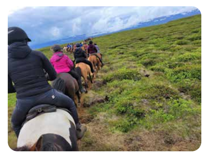
Herd in front of line of riders