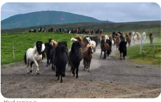
Herd coming in