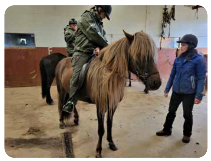
Saddling up - long mane