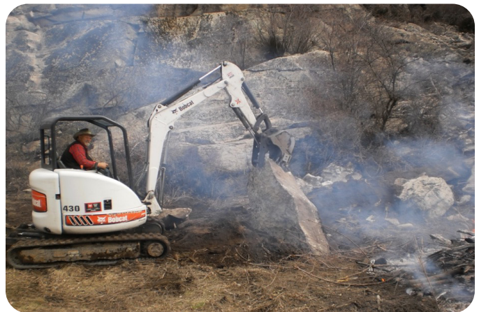
Stan working on excavating the trail.

was hauled out on tarps and then burned in a huge metal box in the gravel area. We also weed wacked the parking lot and the designated horse highline area. A few hiked up to the frog pond trail, where they cleared brush on the short out and back trail. With all the collaboration effort, we accomplished quite a lot of work in one day. Another project to improve the WC trailhead is installing a vaulted toilet. Okanogan County asked OVC to write a letter of support to apply for a grant to install a vaulted toilet. Well of course we did. Okanogan County received the grant money to install the vaulted toilet six months later. OVC is working on another collaboration work party, leaving from the Wilcox camp and trailhead on the other side of this same trail system. We know up here in the north, we are not on the way to anywhere; if you get a chance to visit Okanogan County, check out our beautiful Whistler Canyon Trailhead. Thank you to Margaret Swanberg with the help of photos and her memory of an elephant. See you on the trail. 🐘