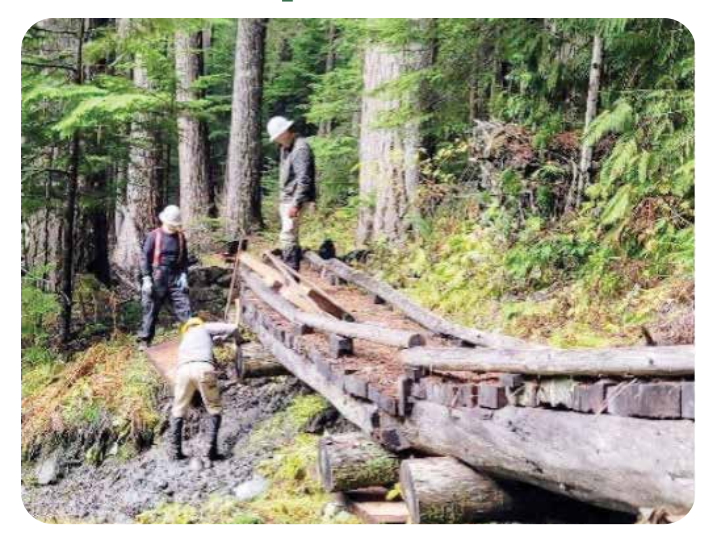
By Rebecca Wanagel, Peninsula Chapter Backcountry Horsemen

Location: Lower Dungeness, Olympic National Forest (a multi-use trail including stock)